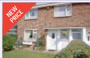
EAST SIDE £124,950 Immaculate Family Home Three Bedrooms Super Conservatory Modern Kitchen/Diner