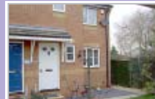
BOWER MANOR £144,950 Three Bedroom Semi Detached Guest Cloakroom Lounge Kitchen/Diner