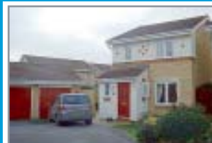
CANNINGTON £675 pcm Detached three bedroom house in cul-de-sac location. Large sitting room, fitted kitchen, large conservatory, three bedrooms and family bathroom. Property further benefits from gas central heating, double glazing, detached garage and large rear garden with views overlooking open fields.