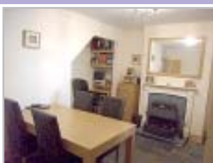
Garden/Sun Room Gas Central Heating PVCu Double Glazing