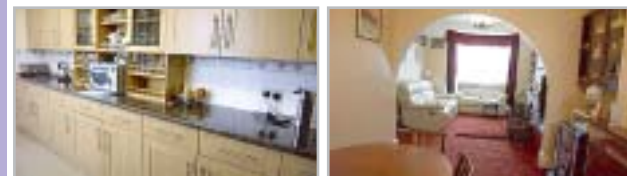
WEMBDON ROAD £184,950 Period West Side Family Home Super Kitchen & Utility Lounge/Dining Room Three Bedrooms Garage & Gardens Some Period Features