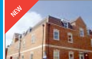
SILVER STREET £425 pcm Unfurnished £425pcm or part furnished £450pcm One bedroom modern apartment close to town centre, kitchen, lounge, bathroom and bedroom, allocated parking.