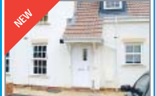
FRIARY WALL £425 pcm £425 unfurnished and £450 furnished - Accommodation comprises: 1 large modernised double bedroom, newly fitted kitchen, large modernised family reception room, cloakroom