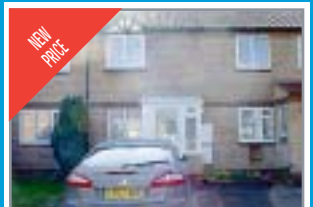
LINLEY CLOSE £495 pcm Two bedroom terrace house on popular bower manor development. Accommodation comprises: entrance porch, lounge, kitchen/diner.