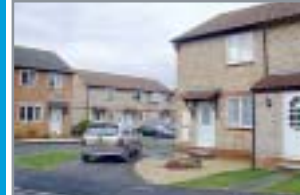
WESTWOOD ROAD £525 pcm Two bedroom end terrace house, lounge, fitted kitchen, two bedrooms, bathroom, conservatory, gas central heating, parking and garden.