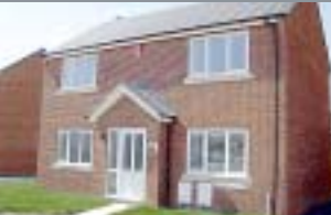
prices start from £550 pcm

CHURCHFIELDS WEMBDON STYLISH FITTED KITCHEN CERAMIC FLOOR TILES TO KITCHEN AREAS INTRUDER ALARM MOST WITH PVCu CONSERVATORY