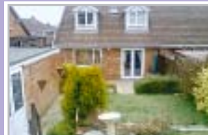
PURITON £176,500 Three Bedroom Semi Detached Home Tastefully Modernised Kitchen/Breakfast Room Garage & Office

SELL YOUR PROPERTY FOR FREE! FULL DETAILS ON OUR WEBSITE www.lindasaunders-estateagents.co.uk or SIMPLY CALL US