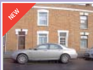
WELLINGTON ROAD £111,950 Traditional Two Bedroom Home Lounge & Dining Room Modern Kitchen & Bathroom