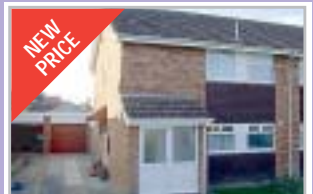
WOOLAVINGTON £77,950 One Bedroom Apartment New Kitchen New Bathroom Lounge

SELL YOUR PROPERTY FOR FREE! FULL DETAILS ON OUR WEBSITE www.lindasaunders-estateagents.co.uk or SIMPLY CALL US