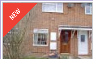
SILVER SPRINGS £111,950 Modern Two Bedroom Home Lounge Kitchen/Diner Gardens