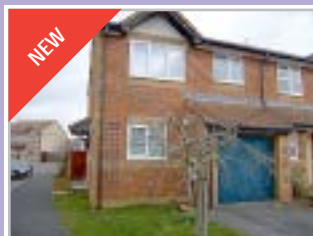
SOUTH SIDE Three Bedroom Semi Detached Garage & Gardens Guest Cloakroom