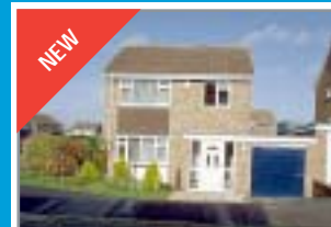
PURITON PARK £725 pcm Three bedroom link detached house, two reception rooms, fitted kitchen, utility room, garage and garden.