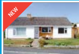
ROSEY DRIVE £725 pcm Three Bedroom Bungalow situated in sought after west side of town. This accommodation comprises lounge/diner, fitted kitchen.