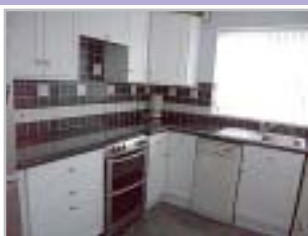
£147,950 New Kitchen Bathroom No Onward Chain