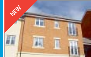
RIVERSIDE CLOSE £475 pcm Accommodation comprises: two double bedrooms, one large family size reception room, well presented fitted kitchen equip with washer/dryer, and white bathroom suite. The property benefits from: gas central heating, double glazing throughout